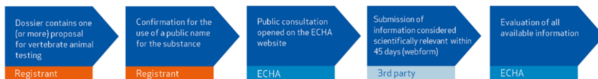
Figure 2: Steps during the third-party consultation

ECHA publishes the name of the substance 9 and the hazard endpoint for which vertebrate animal testing is proposed on its website.